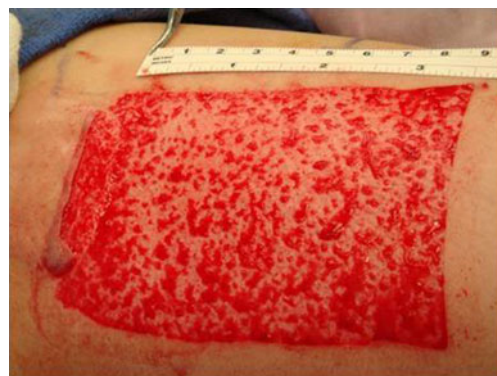
Fig. 1 Intra-operative pictures of donor site

All patients tolerated the dressings and no allergic reactions were observed. The wounds were assessed for characteristics