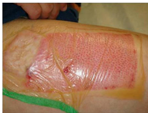
Fig. 4 Donor site wound on post-operative day 8

discharge under the wrinkled OpSite and required removal and daily dressing change with Adaptic and Bacitracin. Four patients had purulent exudates associated with redness. Patients were diagnosed clinically to have donor site wound infection, but no cultures were obtained. One patient developed a rash and two patients had dry crusts on the donor site. One patient had clots that were removed by making an incision in the OpSite. Six wounds healed in 7 days and four healed in 12 days. The transparent dressing appears to offer many advantages over opaque ones and gives a better follow-up of the donor site. OpSite promotes more rapid and less painful healing; however, it tends to be labor intensive, especially if associated with large fluid collection. This problem requires frequent dressing changes. It is our observation that fluid collections are best untreated and that wrinkled or dislodged OpSite should be removed to prevent infection (Figs. 1, 2, 3, and 4).