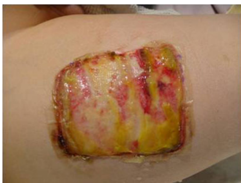
Fig. 11 Donor site on post-operative day 5; notice the incorporation of the product

OpSite is a transparent polyurethane dressing that significantly reduces pain relative to open dressings, but the wound exudates get trapped under it and the dressings have to be changed several times to allow for fluid removal. The accumulated fluid tends to be thicker in consistency over time rendering dressing change more laborious. Even though the fluid is usually sterile [29, 30], clinical infection