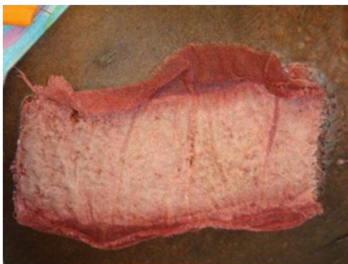
Fig. 7 Donor site at post-operative day 5

Helicoll Helicoll, on the other hand, was well tolerated by patients because of the absence of pain in the donor site and the resulting freedom of movement. Pain was reported on the fourth post-operative day, by eight of our patients, probably because of the degradation of the product and its incorporation into the wound leaving behind a closed wound. The first two cases initially had daily inspection of the wound bed to evaluate the wound healing progress, but this disturbed the rate of wound healing. None of the Helicoll patients had infections. A yellow gel observed on the