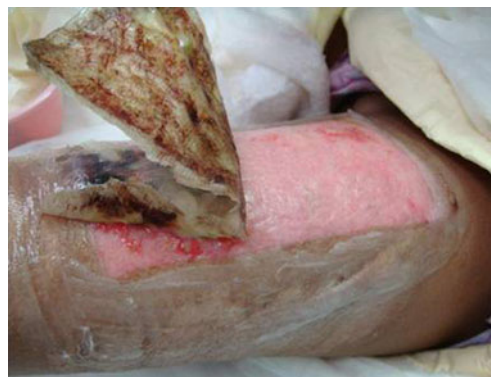
Fig. 12 Donor site dressing removal on post-operative day 8

has been reported and was observed in four cases in this group. In some cases, hematoma formed under the OpSite dressing after ambulation and could not be aspirated further leading to the increased infection rate in this group [31].