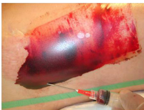
Fig. 3 Post-operative serosanguineous collection and attempt at its aspiration under sterile technique

OpSite Pain started on the fourth or fifth post-operative day in eight patients due to maceration of the wound attributed to fluid collection beneath the OpSite. Fluid collection was seen in all ten OpSite cases. Five patients required a small fenestration of the OpSite to drain the collecting fluid and a new film was used to reinforce the remaining parts of the original dressing followed by a secondary absorbent dressing to prevent constant leaking. Three patients had yellow