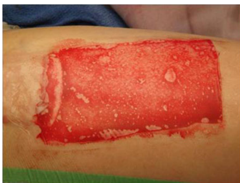
Fig. 2 Application of OpSite to donor site wound

that include comfort, pain level, ability to ambulate and an overall acceptance of the dressing. Relief from pain was the most frequently identified patient benefit. All patients in the Scarlet Red group (100%) had pain, only 25% in the OpSite group reported pain and none of the patients in the Helicoll group experienced donor site pain ( P < 0.05 ).