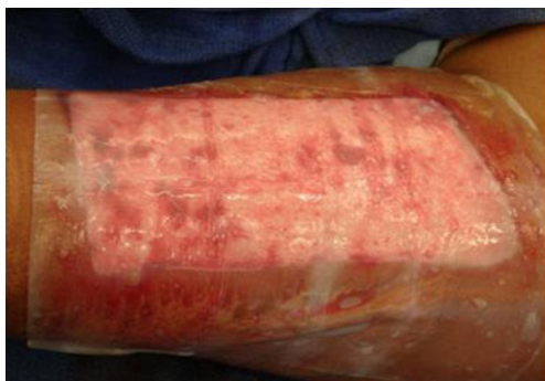
Fig. 10 Helicoll application to it followed by Adaptic and Bacitracin dressings

is a semi-occlusive, self-adhesive collagen membrane with unique advantages of biocompatibility and flexibility. Because it maintains a physiologically moist environment at the wound surface and is biodegradable, it is associated with minimal post-operative wound pain. The traditionally used dressing for donor sites at our institution has been mesh gauze impregnated with Scarlet Red and a synthetic polymer, OpSite. These forms of dressings continue to be cost-effective compared with other types of dressings. Scarlet Red dressings are simple and the most commonly used dressing due to its easy availability, ease of application and low cost. It, however, is associated with delayed healing rates [24] when compared to other dressings. Problems include pain between and during dressing changes. There is even more pain if the dressing has to be removed after being incorporated into the healing site, as it does not always fall off easily. The dressing is adherent and associated with trivial trauma liable to damage the new epithelium [27, 28].