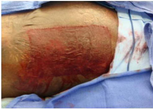
Fig. 6 Application of scarlet red to donor site wound

infections. As Scarlet Red dries, it shrinks and becomes tight over the donor area and this tightness makes ambulation and movement difficult and painful. Although absorption was good in this patients group, three Scarlet Red wounds required unplanned dressing changes because the dressings were soggy and lifted off the donor site. Delayed wound healing was seen in three cases. Wounds healed in 10–12 days. The Scarlet Red dressing is best for scalp donor site grafts. The open technique of leaving the wound uncovered is the least expensive but is very painful and associated with prolonged healing times. Patients seemed to complain most when the rolled gauze fluff was removed on the first post-operative day. The coagulum caused the Scarlet Red to stick to the gauze and removal was quite painful (Figs. 5, 6, 7, and 8).