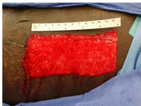
Fig. 5 Donor site at harvest

Patients with Scarlet Red experienced pain on the day of surgery, which limited their movement. Outer dressings were removed on the first post-operative day and it was allowed to dry. None of the patients with Scarlet Red had