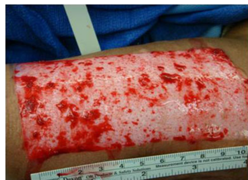
Fig. 9 Intra-operative picture of donor site

STSG donor sites often can be more painful and uncomfortable for patients than the recipient wound. In 1962, Winter [8] and Chang et al. [18–20] demonstrated that moisture enhances wound re-epithelialization and angiogenesis thus accelerating the healing rate. Transparent semi-occlusive dressing with a hydrocolloid base, such as Biobrane, allows fast, yet stable healing with reduced donor site pain but was associated with high infection rates secondary to exudate accumulation [21–23]. Another standard donor site management is to use an alginate dressing. These dressings desiccate and adhere tightly to the wound bed, making it difficult and painful to remove [24–26]. Helicoll is a reconstituted type I pure collagen sheet, derived from a bovine source and free of contaminants such as lipids, elastin or other immunogenic proteins. It