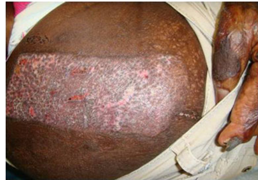
Fig. 8 Donor site at post-operative day 22

fourth post-operative day is due to the degradation of the product. Helicoll wounds healed in 7–10 days. The most valuable aspects of Helicoll include much greater patient comfort on the day of surgery and easier removal of dressings later on. This indicates indirectly the wound healing was significantly increased in the group treated with Helicoll (Figs. 9, 10, 11, 12, and 13).